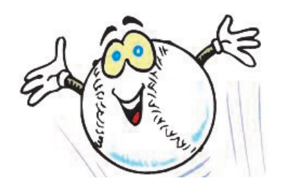
Men's Softball Tournament Patients vs. Alumni